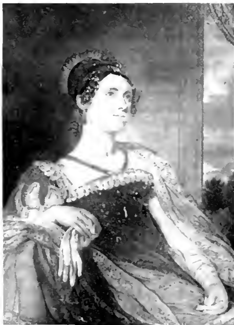
LOUISE CATHERINE ADAMS.

ADAMS, Mrs. Louise Catherine , wife of John Quincy Adams, born in London, England, in 1775. She was a daughter of Joshua Johnson, of Maryland, but passed her early years in England and France. Her father's house in London was the resort of Americans in England. She was married to Mr. Adams in 1797. Mr. Adams had been resident minister at The Hague, and when his father was elected President of the United States, he went as minister to Berlin, Germany. There the young wife sustained herself with dignity in social and political life. In 1801 she returned with her husband to the United States. Mr. Adams was elected to the United States Senate, and they passed their winters in Washington, D. C., and their summers in Boston. In 1808 Mr. Adams was appointed by President Madison the first accredited minister to Russia. Mrs. Adams accompanied him to Russia, and she was the first American woman presented at the Russian court. She made an eminently favorable impression on Russian society. She passed one winter alone in St. Petersburg, while Mr. Adams was in Ghent negotiating a